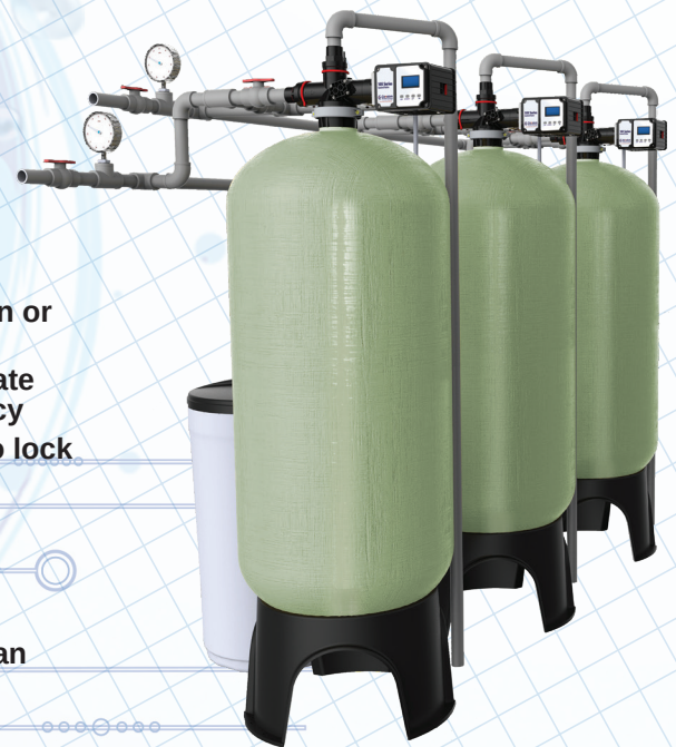
105 MTS System